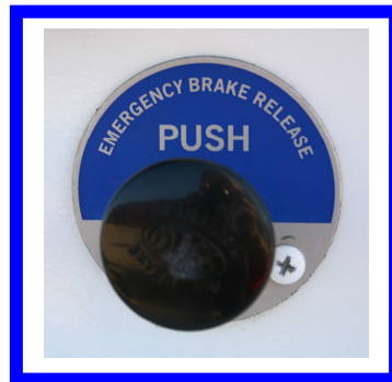
Safety brake stop