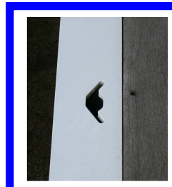
Multiple types of tie downs