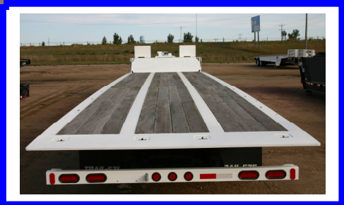
4 I-beam main frame