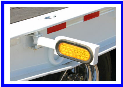
Optional swing-out flashers