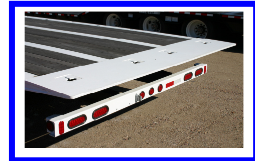
3/4" Approach for easy loading